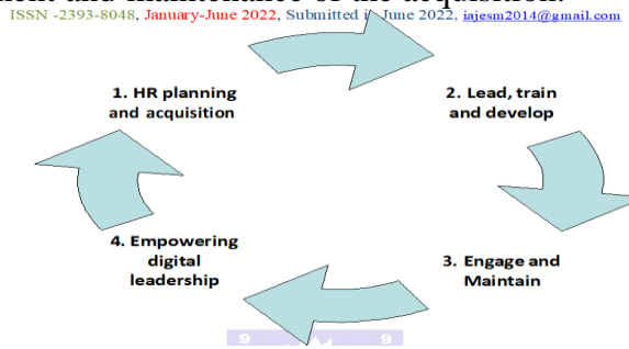
Fig.1.3. Talent Lifecycle

HR plays an important role in helping to manage the talent life cycle from the digital environment, varying from the development and maintenance of the acquisition.