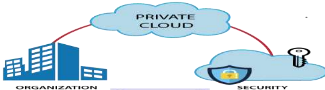
Fig. 3 : Private Cloud

Public cloud : In the private cloud concept, one company sets up its own cloud resources, and its employees are the only ones who may use them. This strategy, which is widely used by governments and large corporations, is excellent in terms of security and can be implemented either on-premises or remotely. As an illustration, consider eBay: