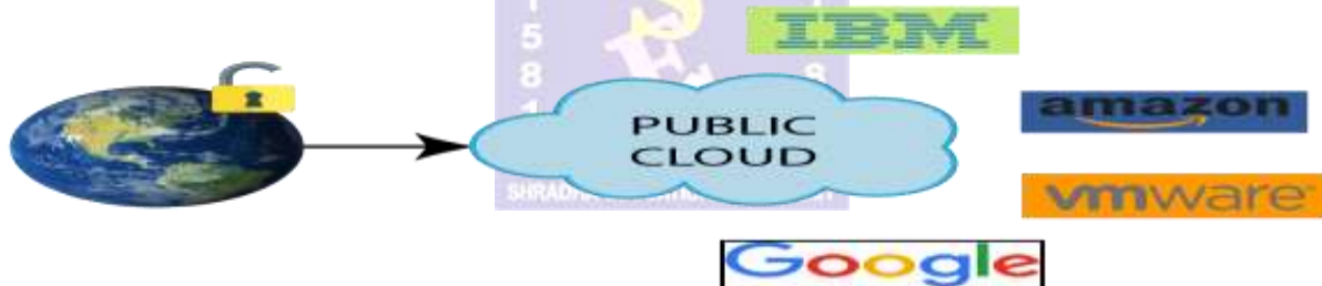
Fig. 3 : Public Cloud

Public( General) Cloud: Public access to the cloud's underlying architecture is now possible. Just like Google or Amason, anyone can use the cloud. Large cloud implementations are found in the public cloud. The aforementioned cloud platforms are only a few examples.