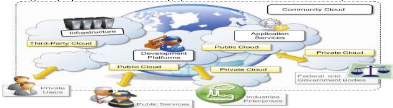
Fig. 5. Community Cloud

Community (domain Specific) clouds: A collaborative effort between several businesses keeps these clouds running smoothly to meet their needs. It's a group of people from different companies that have an interest in using the internet to access and share computing resources. Users typically represent a social or demographic subset with common interests or experiences.