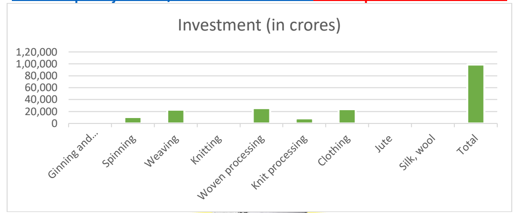
Table 2: Sector wise distribution of corporate insolvency resolution process (CIRPS) as on 2022

Multidisciplinary Indexed/Peer Reviewed Journal. SJIF Impact Factor 2023 =6.753