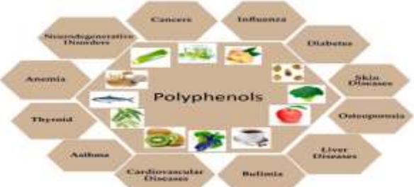
Fig. 4: Combinatorial Epigenetics Impact of Polyphenols and Phytochemicals in Cancer Prevention and Therapy

e) Multi-Targeted Approach: Many diseases involve complex pathways and processes. Combinatorial therapies can target multiple points in these pathways, leading to more comprehensive treatment.