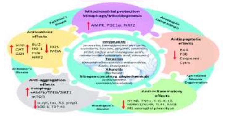
Fig. 3: Mechanisms of Action of Phytochemicals

Gene Expression: Phytochemicals can also affect gene expression, leading to changes in protein production and cellular functions. These changes are often mediated by specific transcription factors that interact with the DNA sequence of genes. For example, sulforaphane, found in cruciferous vegetables like broccoli, can activate the Nrf2 transcription factor, leading to the upregulation of antioxidant enzymes that protect cells from oxidative stress. Resveratrol has been shown to activate genes involved in mitochondrial biogenesis and energy metabolism. By influencing gene expression, phytochemicals can impact cellular processes and contribute to health benefits.