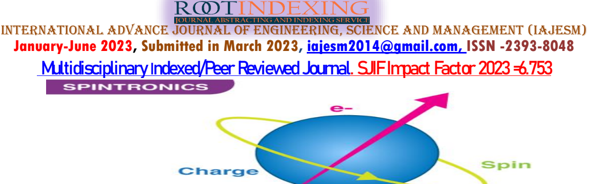
Fig. 4: Spintronics Applications

Magnetic Anisotropy: Magnetic moments can experience different energies depending on