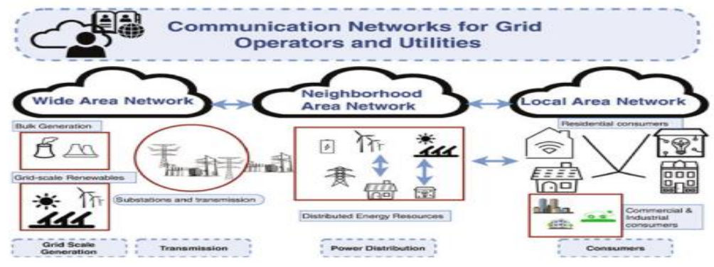
Fig. Communications through the smart grid

The ability to connect devices in the Internet of Things to provide renewable energy sources is significantly reliant on developments in communication technology. These are considered as the cornerstones of sensing and monitoring in energy systems due to the fact that they are an integral part of the control systems for energy and represent a necessary component of that which makes up such systems. The first chapter of this book provides an in-depth analysis of a variety of contemporary communication practices, the vast majority of which can be found in operation today in the energy sector. On the other hand, the focus of this chapter is on the advanced communication technologies that are connected to the Internet of Things and how they may be applied to the field of sustainable energy. This article will offer a general overview of the numerous types of technology. These technological advancements are the driving force behind most of the innovation that has occurred in the field of energy. They also add to the overall efficiency of the energy system in all of its aspects, which helps make the system more beneficial.