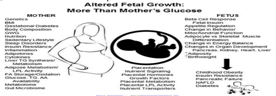
Fig. 1: Beyond glucose, there are other maternal variables that affect prenatal development abnormalities that are connected to juvenile obesity and subsequent metabolic disorders. Both early and late in pregnancy, these variables affect fetal growth in separate and combined ways. Future generations' health can be enhanced by

Maternal Obesity: Maternal obesity is associated with alterations in maternal lipid metabolism, leading to increased levels of circulating triglycerides, LDL cholesterol, and free fatty acids. These maternal lipid abnormalities category to he placenta and impact the lipid composition of umbilical cord blood, predisposing infants to dyslipidemia and metabolic syndrome in early life. Moreover, maternal obesity is linked to chronic low-grade inflammation and oxidative stress, which can further exacerbate lipid disturbances in the fetus.