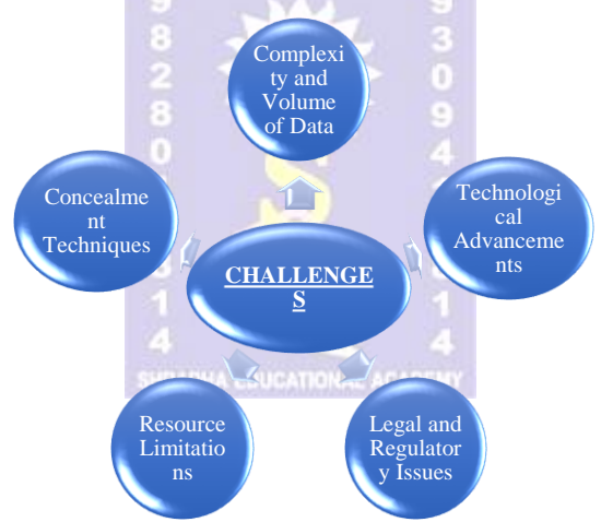
Figure 4: Challenges

Forensic accounting has become an indispensable tool in the detection and prevention of financial fraud. However, its application is fraught with numerous challenges that can impede its effectiveness. These challenges stem from the complexity and volume of data, were handling vast amounts of information and tracing sophisticated transactions demand advanced tools and expertise. Technological advancements, including rapid changes in technology and robust encryption and cybersecurity measures, further complicate the investigative process.