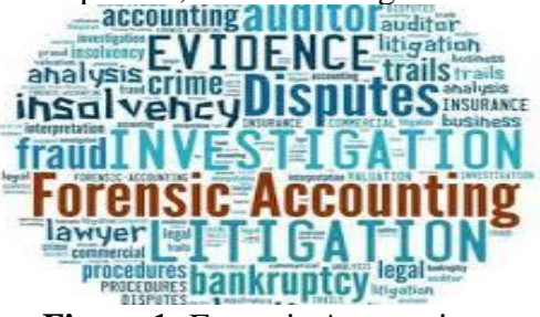
Figure 1: Forensic Accounting

A specialist area of study called forensic accounting is concerned with analyzing financial data and finding proof of wrongdoing, fraud, and financial irregularities. Since its inception in the early 1900s, it has expanded to include a broad range of initiatives aimed at financial crime in diverse contexts. Because of the multidisciplinary character of the field, which blends knowledge from many professions, forensic accountants are able to decipher complex financial transactions and spot concealed fraud tendencies. They have a special combination of investigative skills, analytical aptitude, and knowledge of accounting laws and regulations.