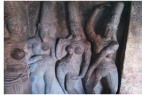
Image No.1.8 Saptamatrikas (Varahi, Kumari, Chamunda), Ravanfadi (Aihole), 7th century AD, Chalukya

Vaishnavis carry chakras and conch shells. A child is on the goddess's left thigh. The virgin's four-hand weapon is unknown. Goddess places her lower right hand on the ground and her upper right on the bun. Uncertain Varahi four hands. Thunderbolts and a lower left hand near the child are among Indrani's four hands. Unknown weapons are in her hands. Numbers denote vehicle yards. The safe hands are on the thigh and upper right. Uncertain vehicle shape below. The goddess wears Kundal, mekhla, wristband, and necklace. In Ellora Cave No. 22 (Neelkantha cave), all Ashtamatrikas have four limbs and Brahmi has three faces.