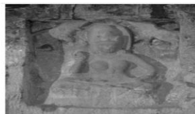
Image No. 1.5 Lakshmi, Ellora Cave No. 22, 8th century AD, Rashtrakuta

Ellora's 8th-century Kailashnath stone temple. The idol is deep-cut Gajalakshmi. The idol's bottom pond has foliage, buds, and flowers. Goddess sits on throne with blooms on each hand. Two snakes sit on lotus. The goddess has a crown and no companion. He consecrates Lakshmi from a vase two yards above the trunk. The water-born deity arrives. The Kailash temple