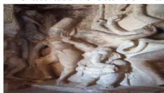
Image No.1.9 Kumari, Ravanaphadi (Aihole) 7th century AD, Chalukya

5.2 Saraswati: Ellora Cave No. 16's right panel depicts Saraswati in tribhanga on a lotus blossom, with fractured legs and missing arms. She wears a crown, necklace, and katisutra, with beautiful vines and a ray mark behind her head. In Cave No. 22, Saraswati is engraved in Padmasana with Chaturbhuji, holding Sanalpadma and Kalash, intricately decorated. The Kailash temple shows Saraswati in sambhanga, with a jatamukut on her head and no upper-body jewelry. Parvati's Panchagni-Idol in Cave No. 16 depicts her standing with four hands, holding a lotus and a yoni-ling, adorned with a crown, armlets, and bangles. In Cave No. 23, Parvati stands with all accessories, holding Akshamala. The Kailash temple shows Parvati admiring her reflection, holding a mirror with intricate bead embellishments. Cave No. 16 depicts Parvati in Chhanavira posture, with Vidyadharas. Elephanta features an eight-foot-six-inch Parvati statue with a chakra behind her head. In Cave No. 16, Gauri holds Akshamala and performs Vara Mudra, wearing kirtimakut and other ornaments. Cave No. 21 depicts a penitent Parvati in Katihasta mudra, surrounded by fire, with a woman in Anjali Mudra behind her. In the Kailashnath temple, Parvati is shown in Tribhanga, adorned with pearl necklaces, bangles,