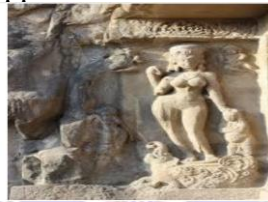
Image No.1.10 Ganga, Ellora Cave No. 21 (Ellora), 7th century AD, Rashtrakuta

5.4 Ganges: Ellora Cave no. 15 has Whirling Ganga . Ganga holds Padma. Chanwar and Chhatra crown the Ganges. 86 A two-handed Makarvahini Ganga figure stands on the east-west wall right of the entrance to Ellora Cave No. 16. Goddess' right hand is on figure's head. Cave 16's statue lies on the north-to-south wall right of the entrance's first step. A massive Ganga figure with two arms graces this Makar Vahana. Supporting figures stand. Above is a garland. Ganga's head is umbrella-topped.