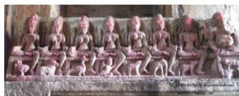
Fig. 1.6 The Strip of the Saptamatrikas, Huchimalliguri, (Aihole), 7th century AD, Chalukya

5.1.3 Saptmatrikas: Ellora Cave No. 14 A heavy and large panel of Saptamatrikas is depicted in which the goddesses are with their children. Brahmi has a deer skin on his left shoulder. A swan painted pillow has been placed under the seat of the goddess. After Brahmi, Goddess Maheshwari is accompanied by her vehicle, the bull. Kumari with her vehicle peacock, Vaishnavi with Garuda, Varahi with pig, Indrani with elephant and Chamunda with owl. All the matrikas are sitting in the Savya Lalitasana posture.