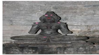
Image No. 1.14 Saraswati, Gadag (Karnataka), 11th century AD, Chalukya