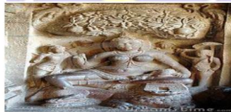
Image No.3.12 Ambika, (Jain Devi) Ellora Cave No. 33, 9th century AD, Rashtrakuta

5.5.1 Star: On the left wall of Ellora Cave No. 16, a Tara idol stands with her right hand removed. His left hand holds a lotus bud. The goddess's beauty comes from garments and accessories. A deer is on his left shoulder. A man figure worships the goddess with folded hands to her left. The man's hairline is on the left. A maid idol with bangles in her right hand and a bent left hand stands to Tara's left. The Tara idol in Ellora Cave 10 is in Savya Lalitasana with a lotus flower in her left hand. A lotus-holding man is below the goddess's idol. The cave has another sitting Tara statue. The goddess wears a crown, 101 coils in her ears, a diamond necklace, wristband, and chest-inscribed necklace. Ellora Cave No. 12's Tara idol shows the goddess in Lalitasana on a double-leafed lotus. Goddess wears a crown. Right hand in groom's pose, left hand holding lotus flower. Ellora Cave No. The left sub-chamber of 6 has a female idol wearing a star Crown. Female and male hostesses flank her. Not Ellora Cave. Tara's right hand is in boar pose and her left hand is likely a lotus flower in the first panel of 10. The goddess wears a crown, bracelet, hero's necklace, lotus band, armband, and breastplate. Mammoths reach the goddess's chest. Not Ellora Cave. The left-side Tara idol at 12 has her right hand in the groom's position. The left hand has a lotus bud. The goddess wears a crown, earring, necklace, and armlet.