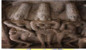
Image No.1.7 Saptamatrikas (Brahmin, Maheshwari, Vaishnavi), Ravanfadi (Aihole), 7th century AD, Chalukyas

headless. Goddess has four arms. The goddess sits in Paryakasana on a lotus. The goddess wears armlets, bangles, necklace, and garland. The swan is the goddess's transport. Parvati sits in paryakasana on her vehicle bull.