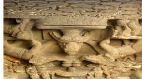
Image No.1.3 Mahalaxmi, Kailash Temple, 8th century AD, Rashtrakuta

5.1.2 Gajalakshmi: Ellora Cave No. 14, Gajalakshmi is depicted as seated in Lalitasana posture on a two-petaled lotus flower. The goddess is adorned with a necklace around the neck, a coil in the ears, an armlet and a crown. Two celestial attendants with four hands are depicted holding pots around. The two yards above the attendants are shown showering water on Gajalakshmi.