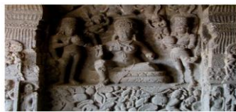
Image No. 1.4 Mahalaxmi, Ellora Cave No. 14, 8th century AD, Rashtrakuta

Ellora Cave No. 14. On the northern wall of 14 is the idol of Gajalakshmi. The right hand of the two-armed Devi, seated on the pedestal, is depicted in Abhaya Mudra. The goddess is shown being anointed with four yards. The marking of water below is clear from the figures of Kachchap and Nag.