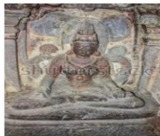
Image No. 1.15 Saraswati, (Jain Devi) Ellora Cave No.32, 8th century AD, Rashtrakuta Ellora Cave No. 15 depicts a woman holding a flower in her right hand and her left hand on her hip. She has a wavy ruffle between her knees and her shoulders and arms covered. She has no attendants. Dwarapalikas (female door guardians) reach the cave ceiling at Ellora Cave No. 29. They hold lotus blossoms in their right hands and lay their left hands on their waists while

5.7 Woman Idol Playing with Flute: In Ellora Cave No. 15, a statue shows a lovely maid playing a flute with her right hand. A woman holds a child at the man's feet in another cave scene depicting a love story. Medium-sized female servant figures with vague features have lower clothes draped around their bodies and waving between their ankles. These characters' heads are lost, but their upper parts are clear. A sculpture of a chauri-bearer woman with dwarf maidservants twisting her hair is in Ellora Cave No. 26.