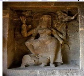
Image No.1.2 Durga, Ellora Cave No. 14, 8th century AD, Rashtrakuta

The Ellora caves feature numerous statues of Mahishasurmardini. In Rameshwar Cave, she is shown with four arms, holding an animal's trunk and armor, while crushing a buffalo with her right leg. The Kailash Temple houses an eighth-century statue depicting her battle with Mahishasura, with eight arms wielding various weapons, creating a circle of influence around her head. The goddess is shown riding a lion and attacking a buffalo-like demon, supported by her attendants. In Cave No. 21, a ninth-century statue shows Mahishasurmardini in Alidha Mudra, holding the snout of a buffalo-like demon. She has four arms and is adorned with ornaments. Another statue in Cave No. 14 shows the goddess in Pratyalidha posture, standing on a lion with four hands, one holding a trident. In Cave No. 15, she is depicted with four arms adorned with all ornaments, attacking a human form of an asura emerging from Mahisha's head. In Cave No. 27, a 10th-century idol shows Mahishasurmardini with eight arms, holding various weapons, and standing on Mahishasura's back. In Cave No. 16, she is depicted with ten arms, holding different weapons, emerging from the mouth of Mahisha, and standing on the neck of a human asura. The goddess is shown with a crown, necklace, armlets, and bangles,