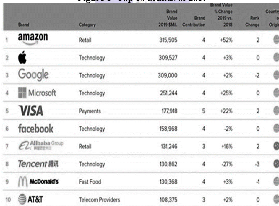
Figure 1- Top 10 brands of 2019