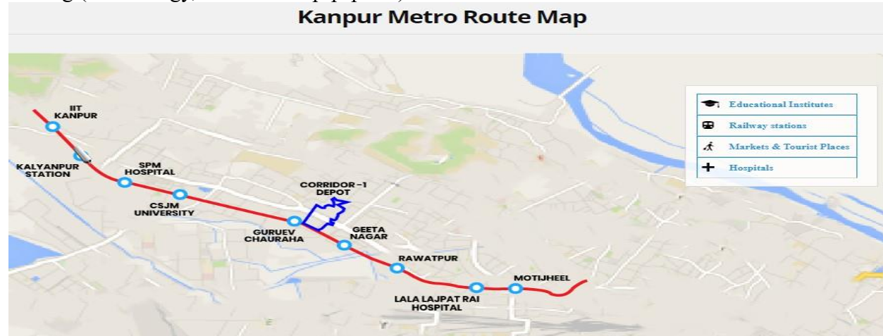
Figure 1 Image of existing orange line

Phase 1 of the Kanpur Metro project is expected to cost roughly Rs 11,000 crore. Rail India Technical and Economic Service (RITES) created the DPR (Detailed Project Report) for Kanpur Metro Phase 1, which included 32.5 km of routes. It was authorised by the State Cabinet in March 2016 and the Central Government's Cabinet in February 2019. The project is being funded with a EUR 650 million loan from the European Investment Bank (EIB), which was granted on July 15, 2020, as well as equity contributions from the governments of India and Uttar Pradesh on an equal footing (Technology, 2022 future prpspects).