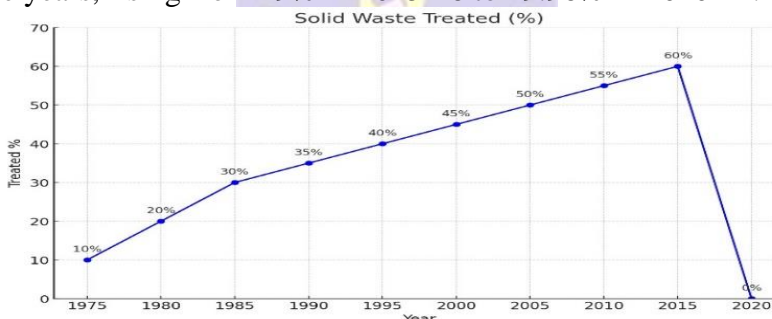
Figure 3: Year wise solid waste treated (%)

Processing solid waste: Figure 2 shows the trend of the proportion of solid waste processed from 2015 to 2011. The proportion of solid waste that is processed has been steadily climbing over the past five years, rising from 19% in 2015-16 to 49.96% in 2020-21.