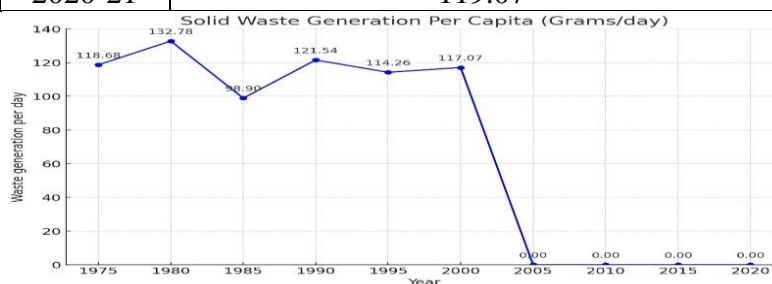
Figure 2: Solid Waste Generation Per Capita (gm/day)

Processing solid waste: Figure 2 shows the trend of the proportion of solid waste processed from 2015 to 2011. The proportion of solid waste that is processed has been steadily climbing over the past five years, rising from 19% in 2015-16 to 49.96% in 2020-21.