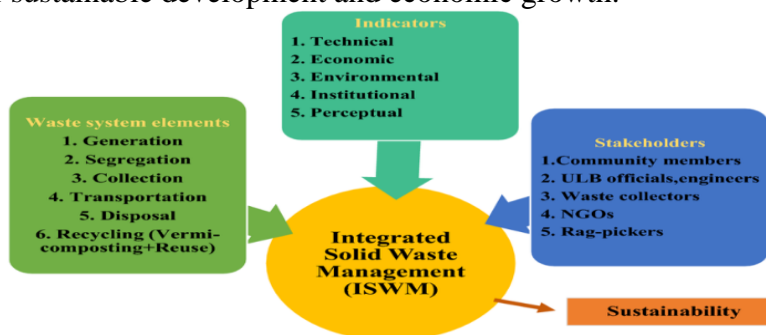
Figure 1: Dimensions of integrated solid waste management Source: Adapted from Scheinberg (2011)

https://www.researchgate.net/figure/Dimensions-of-integrated-solid-waste-management-source-Adapted-from-Scheinberg-2011_fig1_361240284