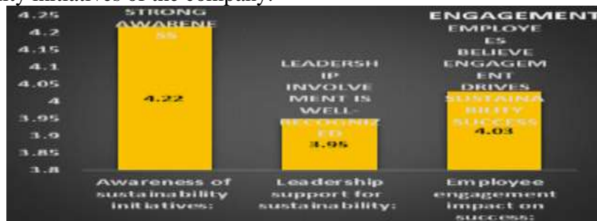
Figure 2 The positives of the Sustainability Awareness Situation

The positive points observed in the report depicts a higher awareness amount the staff in terms of sustainability initiatives of the company.