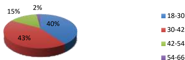
Figure 1 Age Distribution as Gulf Catering and Support Services.