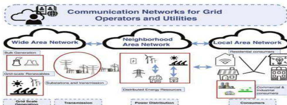
Fig. Communications through the smart grid

The ability to connect devices in the Internet of Things to provide renewable energy sources is significantly reliant on developments in communication technology. These are considered as the cornerstones of sensing and monitoring in energy systems due to the fact that they are an integral part of the control systems for energy and represent a necessary component of that which makes up such systems. The first chapter of this book provides an in-depth analysis of a variety of contemporary communication practices, the vast majority of which can be found in operation today in the energy sector. On the other hand, the focus of this chapter is on the advanced communication technologies that are connected to the Internet of Things and how they may be applied to the field of sustainable energy. This article will offer a general overview of the numerous types of technology. These technological advancements are the driving force behind most of the innovation that has occurred in the field of energy. They also add to the overall efficiency of the energy system in all of its aspects, which helps make the system more beneficial.