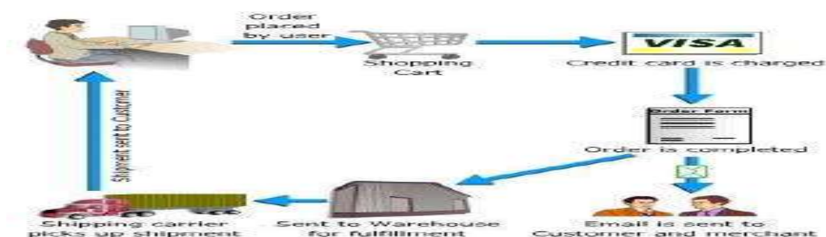
Fig 1: E-Commerce transaction cycle